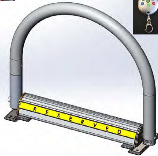
MySpot 500 Remote-Controlled Barrier