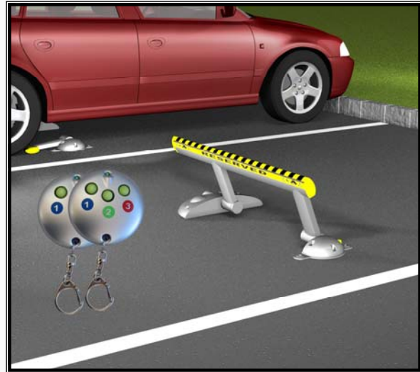
MySpot 200 remote-controlled barrier and remotes. It automatically rises after the car pulls out.

If excessive force is applied to the barrier, a safety mechanism acts to disengage the barrier from the PowerPod. This prevents internal damage to the pod mechanism, to